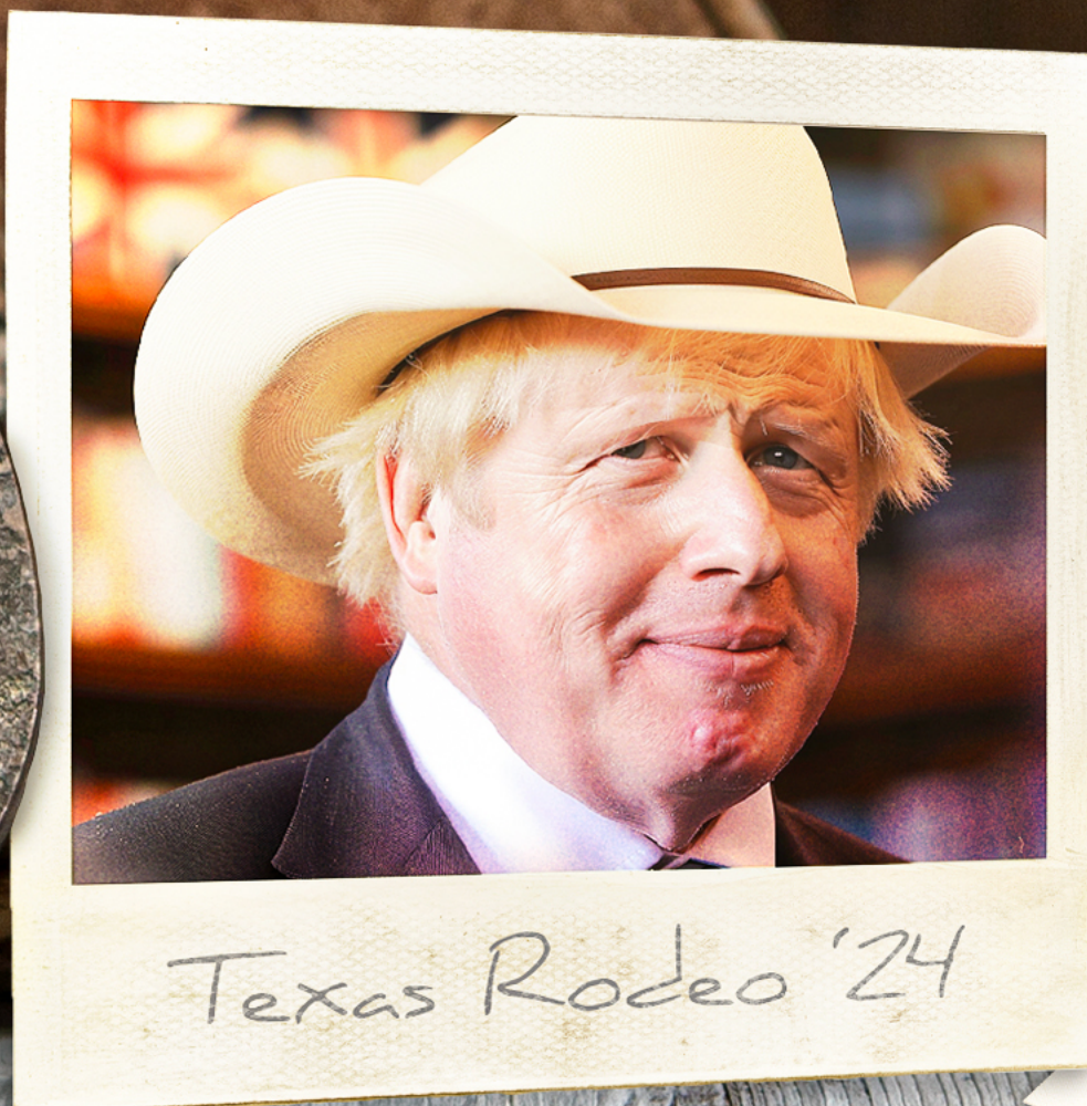
Texas Rodeo '24